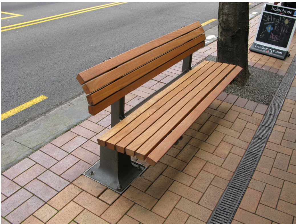
Golden Mile Seat, Manners St., Wellington

Where high quality public seating spaces need to be maximised in a city street or mall environment, the classy Golden Mile Seat is a practical option that will give many years of service.